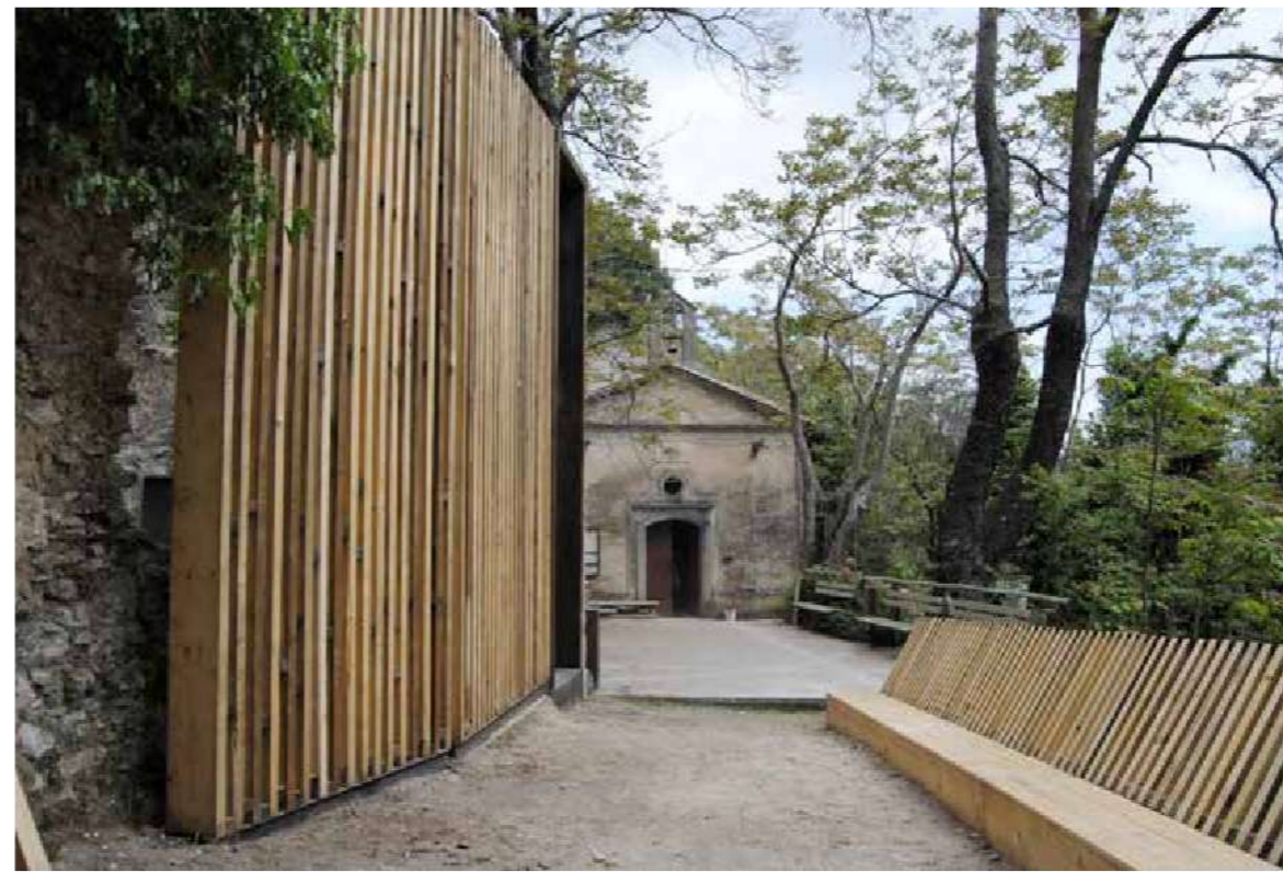
Some views of Estia. the hearth room, the result of the design and self-build workshop.